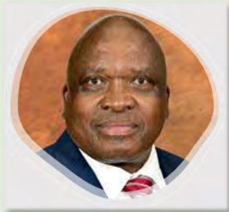
Dr MJ Phaahla